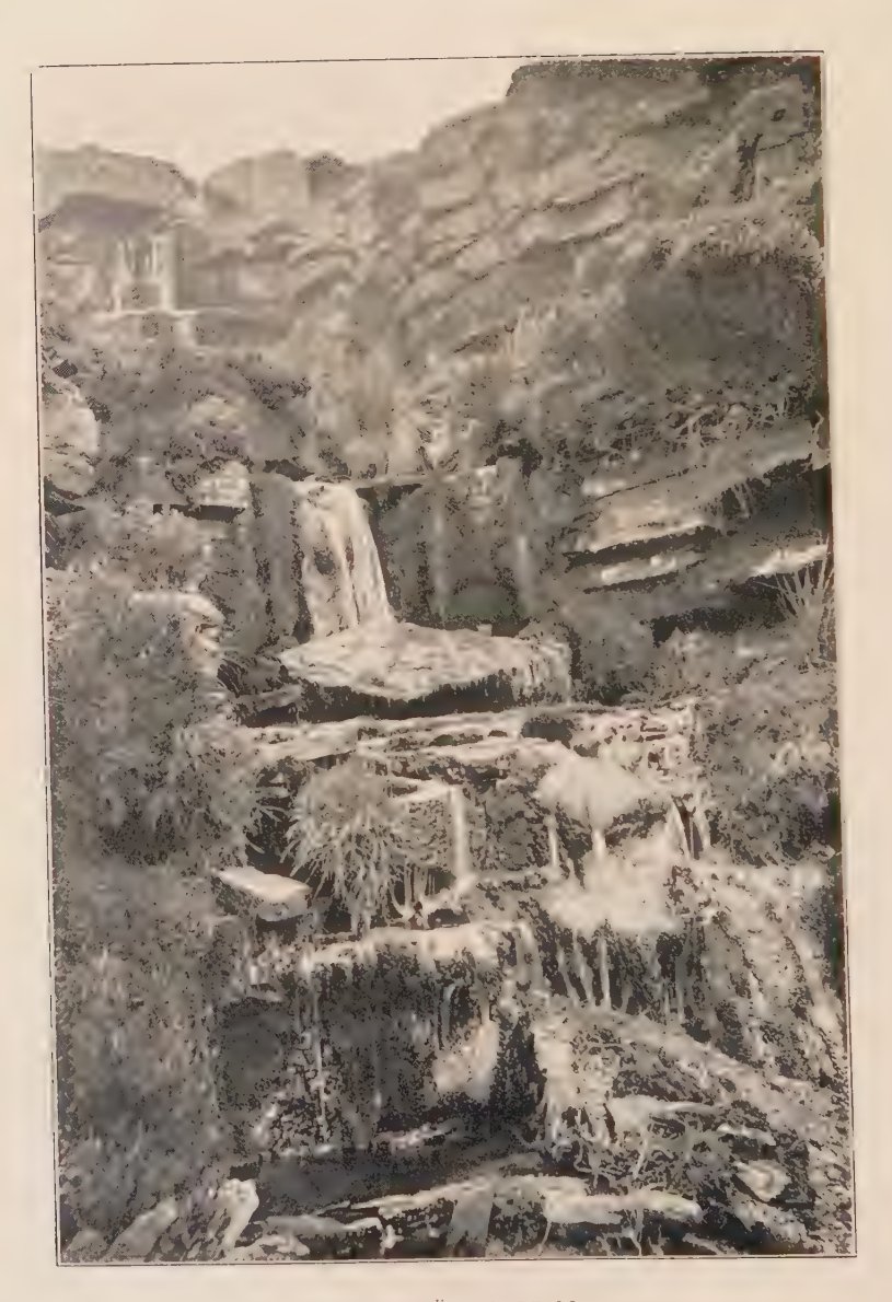
THE BRONTË WATERFALL.